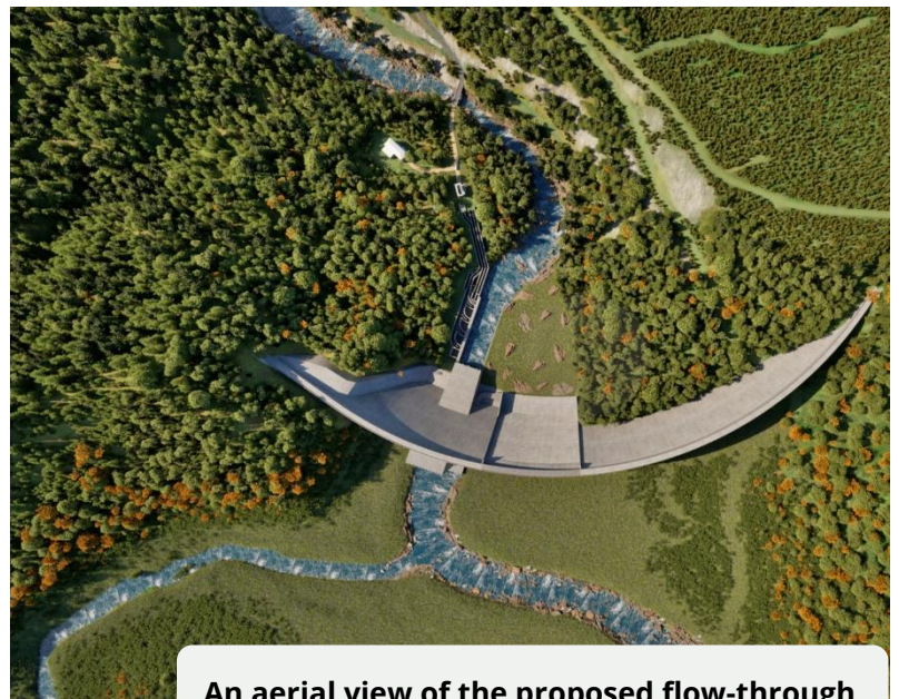
An aerial view of the proposed flow-through dam near Pe Ell.

Following the devastating floods of 2007 and 2009, the Lewis County Board of County Commissioners formed the Chehalis River Basin Flood Control Zone District (Flood District) to find solutions to reduce flood risks, protect basin communities, and preserve the ecosystem benefits the Chehalis River system provides. The Flood District developed a proposal for a new flow-through dam for flood control to address major floods in the upper Chehalis Basin between Pe Ell and Centralia.