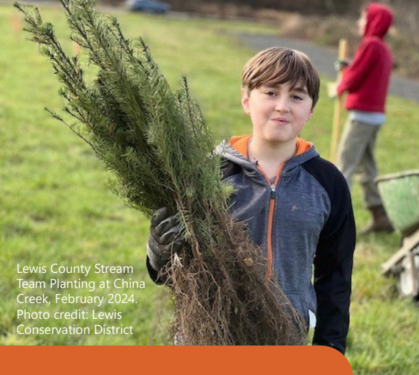
Lewis County Stream Team Planting at China Creek, February 2024.

The Aquatic Species Restoration Program is a science-informed program funded by the Department of Ecology's Office of Chehalis Basin and approved by the independent Chehalis Basin Board. The program is designed to improve and restore aquatic habitat and help protect communities from damage caused by major floods in the Chehalis Basin.